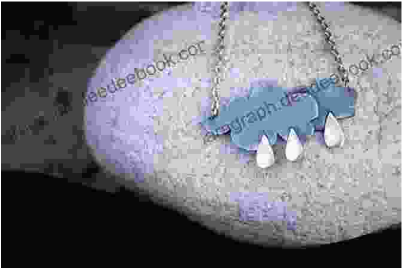
DIY Jewelry making pattern Rainy sky pendant, Practical Step by step Guide on How to make