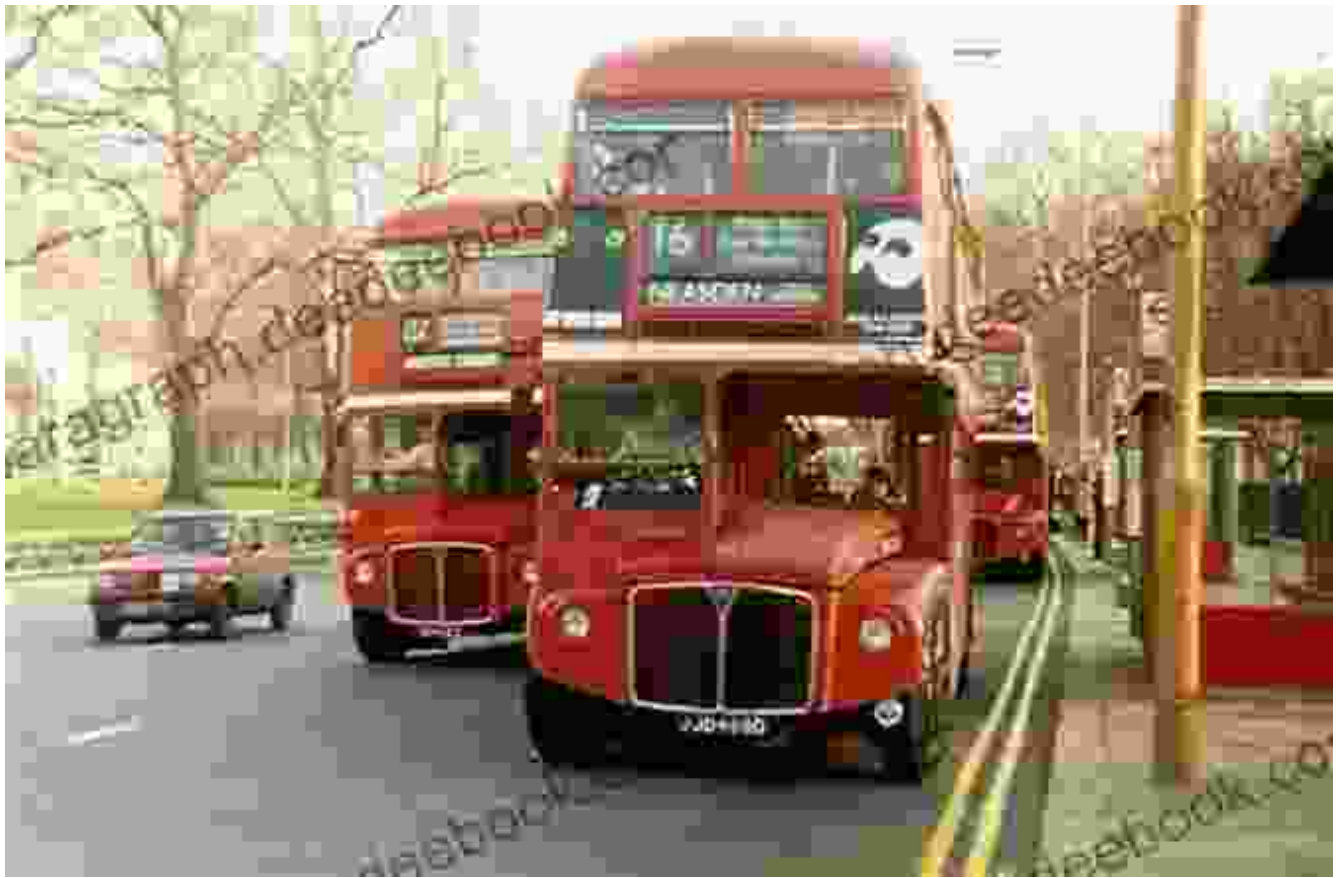
A Routemaster bus in the 1980s