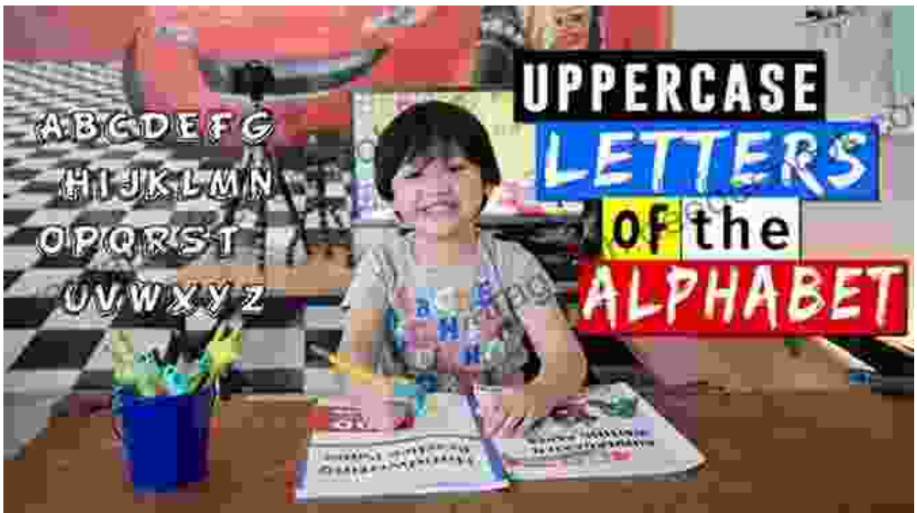
Mwangi's First Encounter with the Alphabet

Next, it was time for literacy lessons. Mwangi had never seen letters before, but he was eager to learn. Mrs. Mwangi introduced him to the alphabet, tracing each letter with her finger on the whiteboard. Mwangi followed along, his mind absorbing the new knowledge like a sponge.