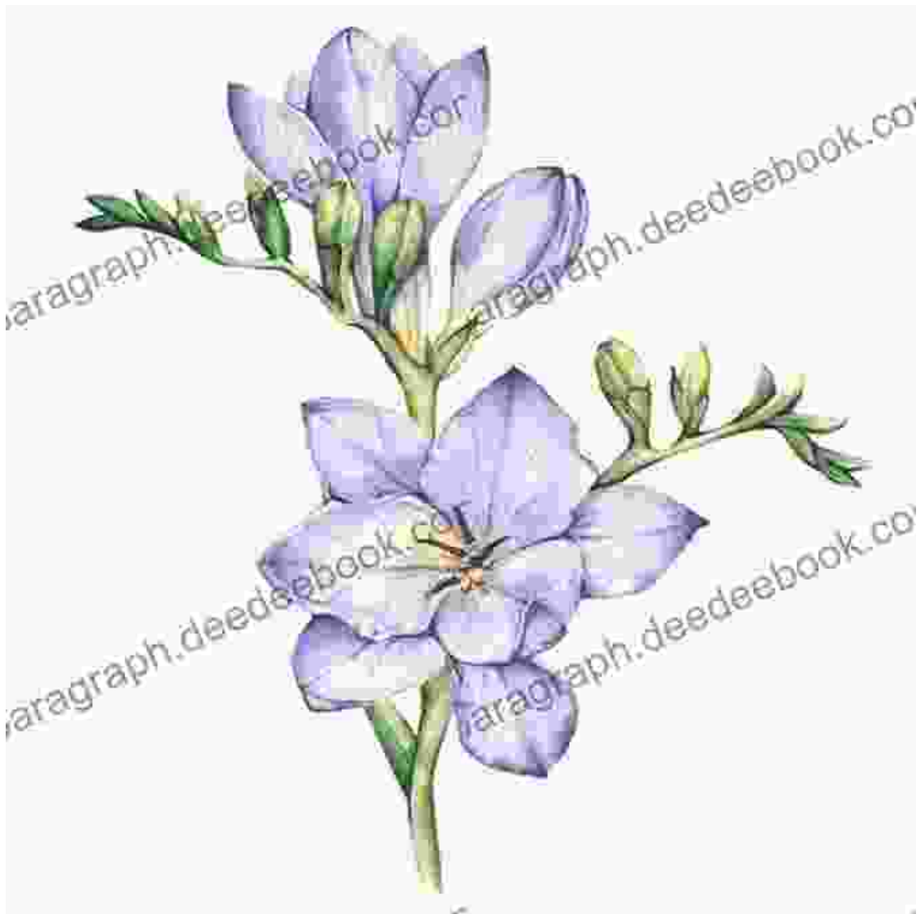
Freesia, Watercolor on Paper

Soft brushstrokes evoke the velvety texture of the freesia's petals, while washes of color bring to life their vibrant hues. Whether rendered in monochromatic simplicity or a vibrant array of pigments, these drawings capture the essence of the freesia's delicate beauty and intoxicating fragrance.