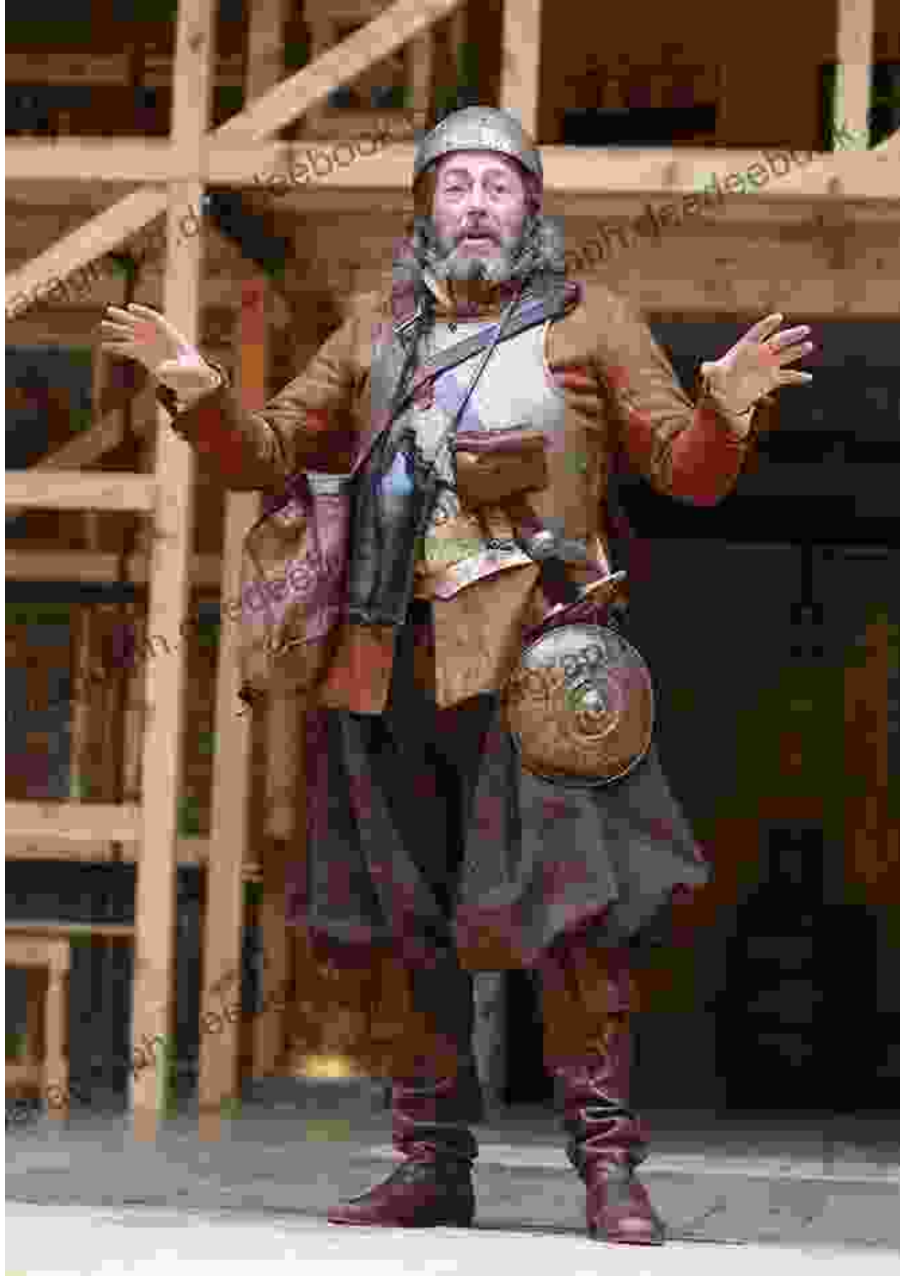
Roger Allam as Falstaff in Henry IV, Part 1