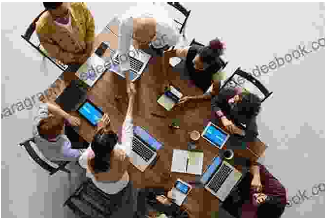
The Buzzzzz Rag editorial team

As an independent media outlet, The Buzzzzz Rag operates free from the constraints of corporate influence and commercial interests. Its contributors are driven by a passion for truth-seeking and a commitment to providing readers with unbiased and thought-provoking content.