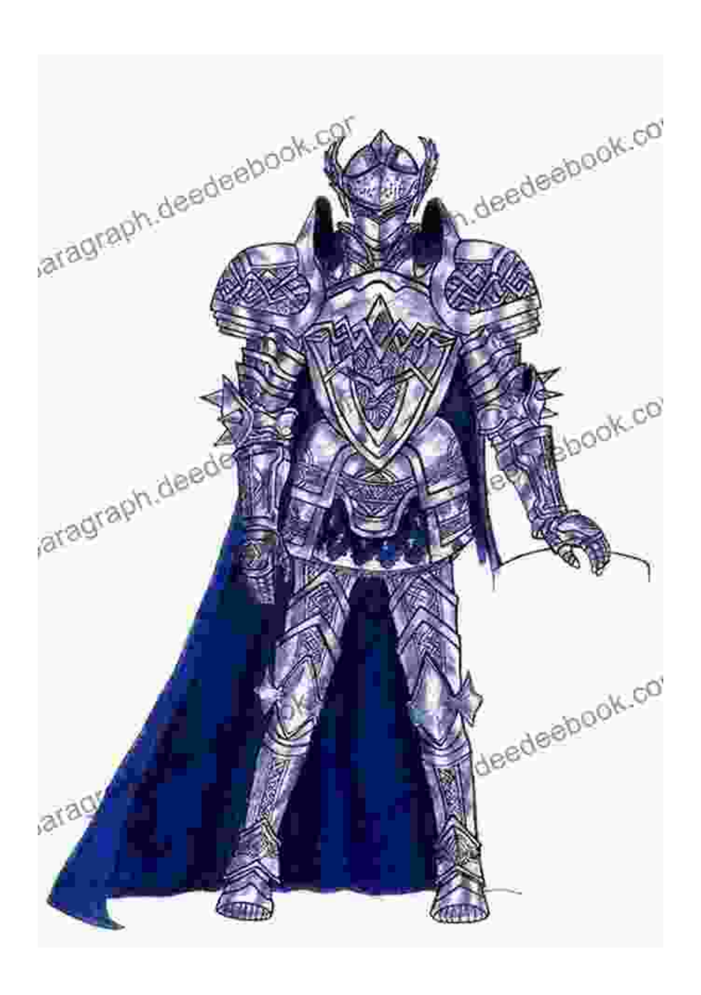
The Night King, an embodiment of primal fear and the threat of unending darkness

embodies the primal fear of the unknown, the horrors that lurk in the shadows, waiting to unleash their fury upon the unsuspecting. Through the Night King's relentless march and the looming threat of the Long Night, Martin explores the fragility of civilization and the devastating consequences of unchecked evil.