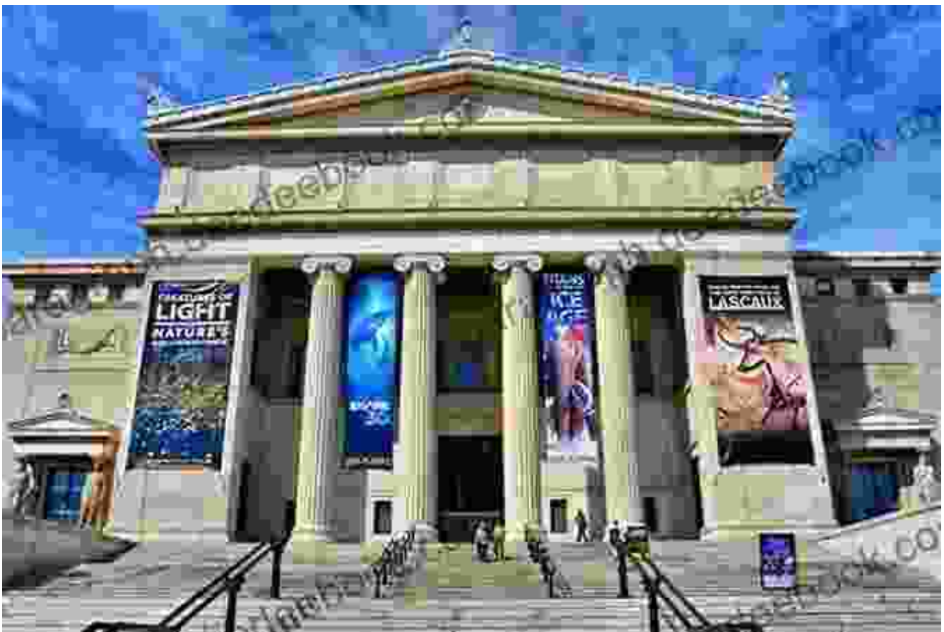
The Field Museum of Natural History in Chicago, Illinois.

Field's legacy is still alive today. The Marshall Field & Company department store continues to operate in Chicago, and the Field Museum of Natural History is one of the most popular tourist attractions in the city.